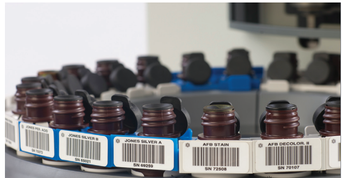
Reduce technicians' exposure to harmful chemicals with ready-to-use staining kits.