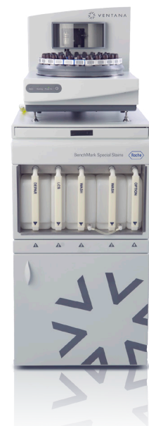
BenchMark Special Stains automated slide stainer

The VENTANA BenchMark Special Stains platform offers a new level of automation for special stains. Productivity features such as the ability to run any test next to any other test and bulk and waste fluid sensing improves turnaround time and optimizes workflow. The VENTANA System Software uses an intuitive user interface to operate the BenchMark Special Stains instrument. Reduce manual processes and improve your lab capabilities by allocating your skilled laboratory professionals to higher value contributions.