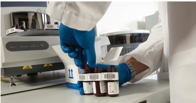
Appreciate features like easy slide loading and unloading, ready-to-use kits and an integrated retractable work surface.