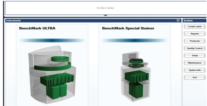
Connect VENTANA BenchMark ULTRA & BenchMark Special Stains instruments through a single intuitive user interface (VENTANA System Software).