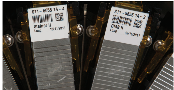
Run any test next to any other test with independent slide heating. Help protect patient samples with individual slide staining — take it further with VENTANA VANTAGE workflow solution for patient sample chain of custody.