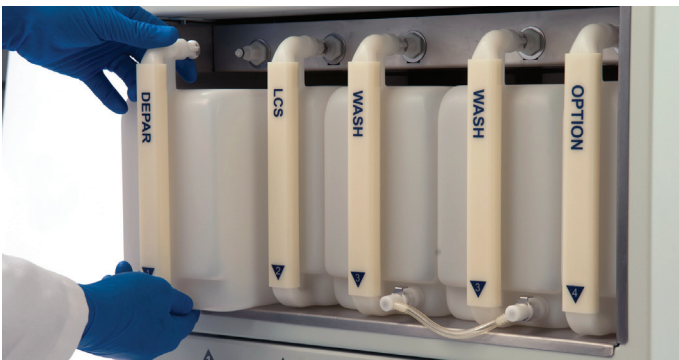
Improve efficiency and ensure adequate fluid capacity with integrated bulk reagent and waste sensing.