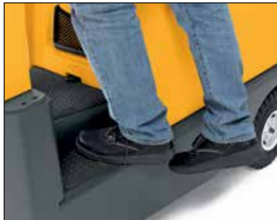
Ergonomic low step for effortless entry and exit to and from the vehicle