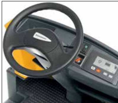
Clear layout of controls provides easy operation of the tow tractor