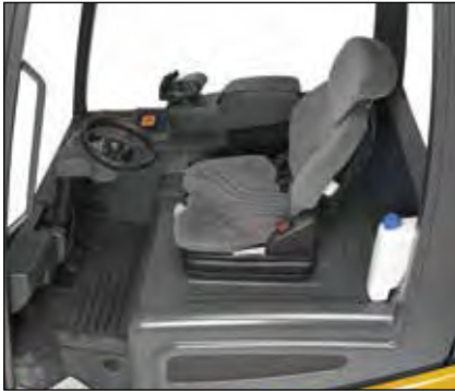
Ergonomic operator compartment