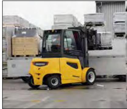
A smooth ride even in outdoor applications