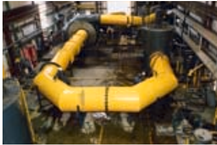
GIW Hydraulic Laboratory

An essential part of any mining infrastructure, KSB pumps help ensure cost-effective, continuous operations. Our solutions always focus on the customer, so KSB strives to make pump planning easy by providing products for every step of the mining process – solutions that have proven themselves over time. From the heart of the mine right to the end product, KSB powers the future of high quality, safe mining.