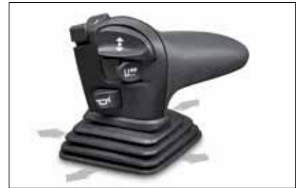
MULTI-PILOT hydraulic control (optional)